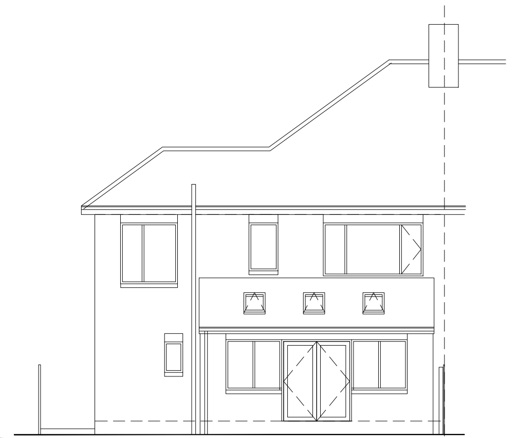
existing rear elevation